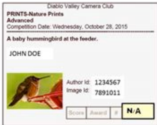
Example of a correct club label