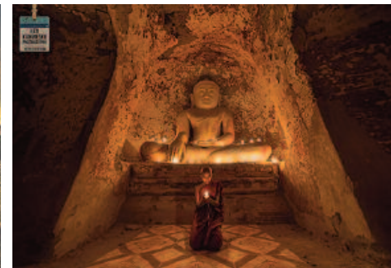
All three photos ©Ken Kaminesky