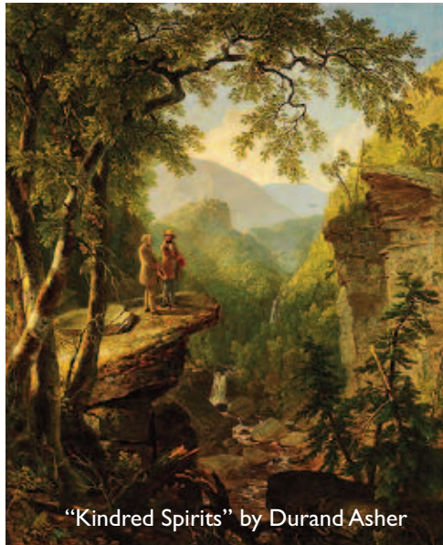
“Kindred Spirits” by Durand Asher

See his biography under his Keynote Speaker information on Page 6..