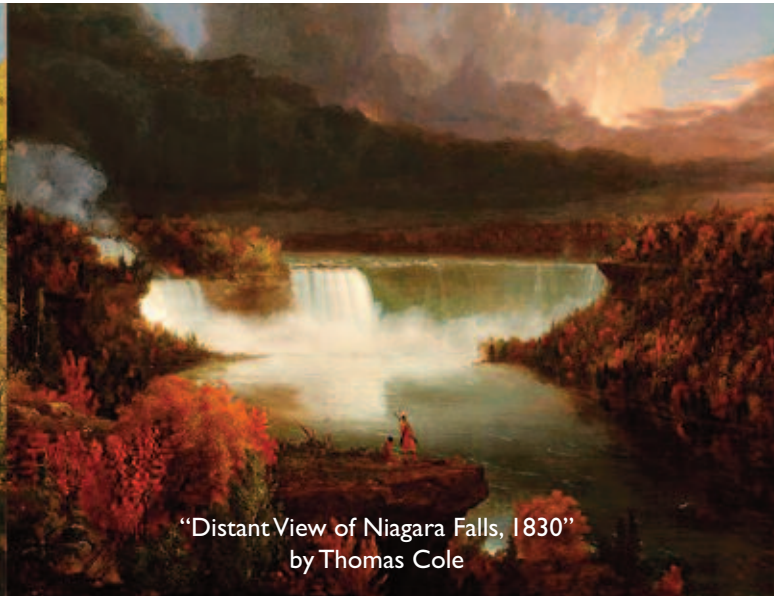
“Distant View of Niagara Falls, 1830” by Thomas Cole