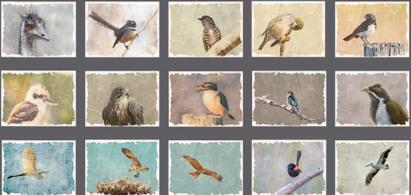
Example of PSA Portfolio Entry Composite Slide.

“Expand Your Photographic Horizons with Portfolios”