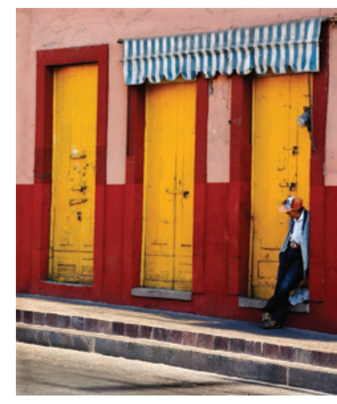
Man and doors

For those who like to photograph peeling paint, torn posters, and decaying cars Guanajuato provides plenty of opportunities. A good thing to do on the afternoon of the first day is to go up the