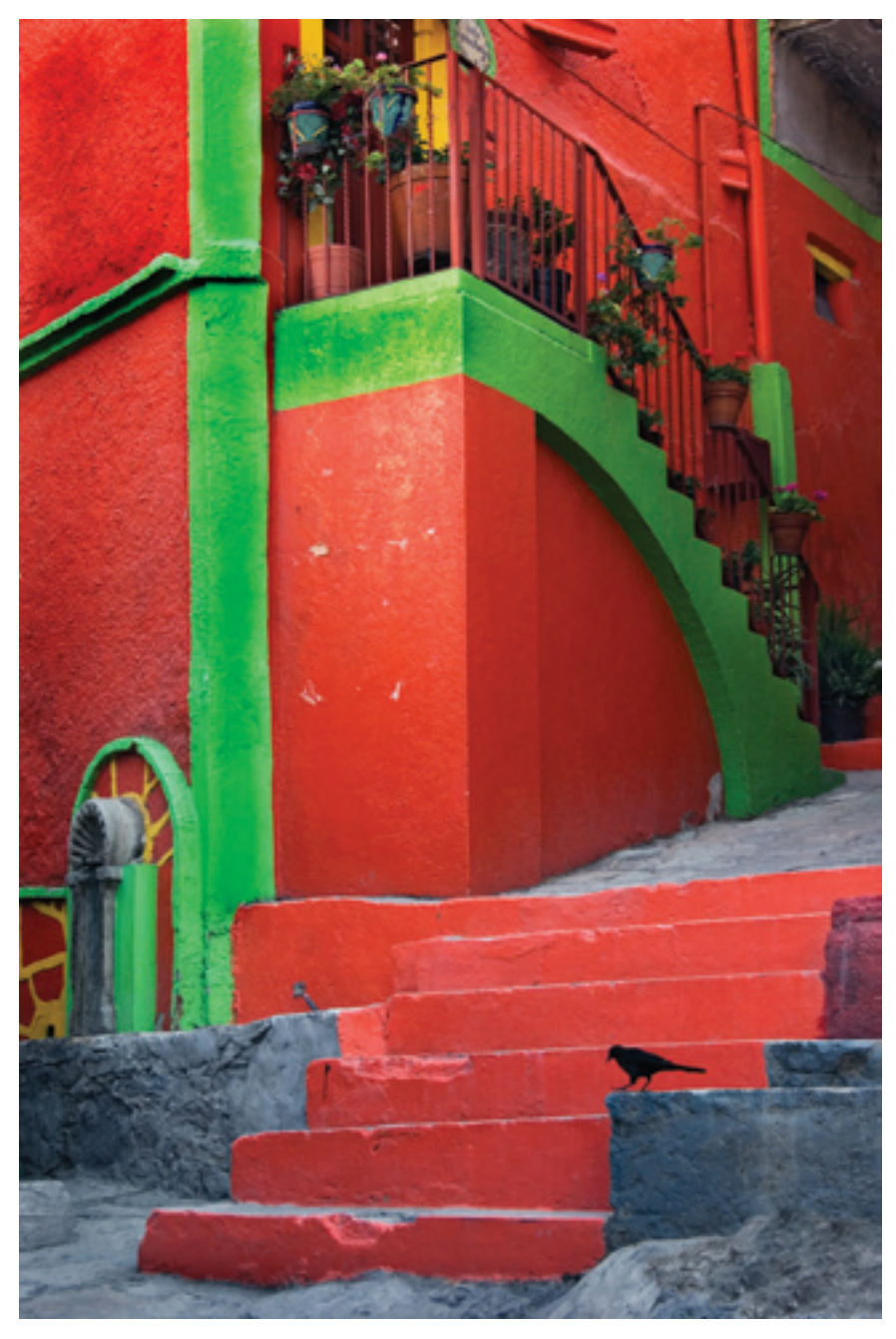
Red and green stairs