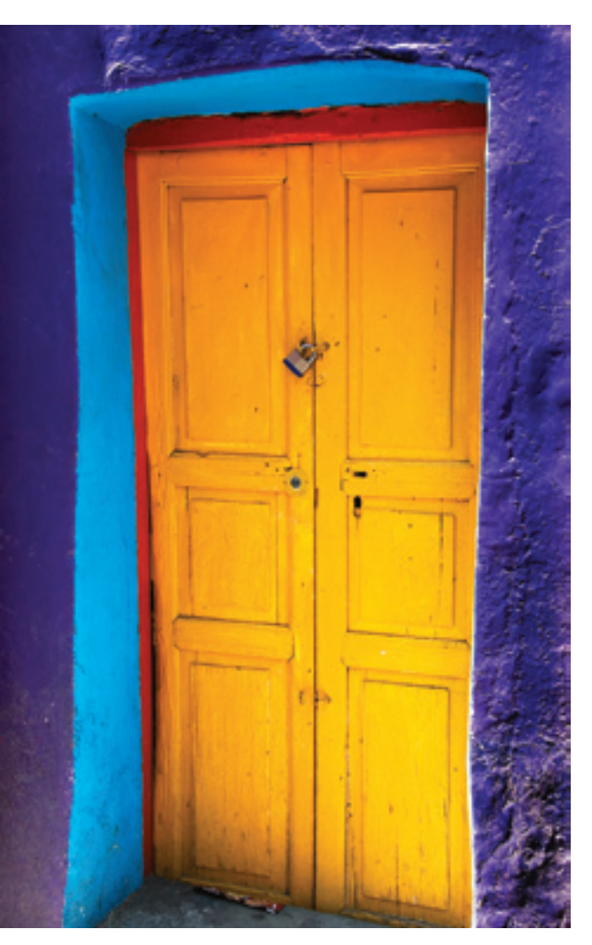
Yellow door PSA Journal • March 2008

Guanajuato (pronounced guan-a-HWAT-o) is somewhat larger and even more colorful and striking than San Miguel. A town of about 100,000 people, it is at an elevation of 2000 m, or 6700 ft. The downtown is fairly small, about 1 km long and about 300 m wide, and there are three more or less parallel main streets (two in some places). They are all worth exploring on the first morning of a visit, and lead to the main plazas and churches. The churches are colorful, and have shapely domes, and are certainly of interest. A city map can be found, as of this writing, at: http://www.dq-guanajuato.com/dq-guanajuato/ guanajuatocity.pdf